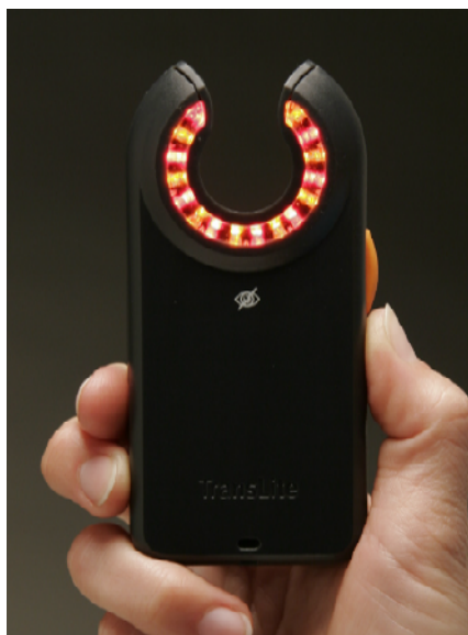
Figure 2. VeinLite LED